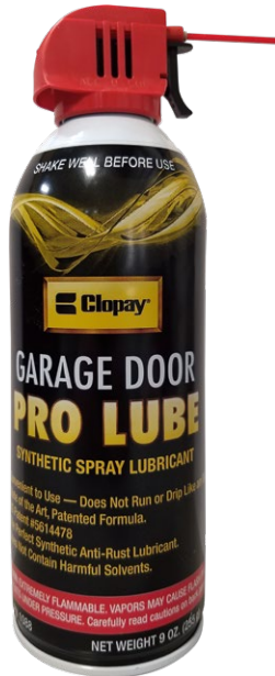
PRO LUBE Garage Door Spray Lubricant