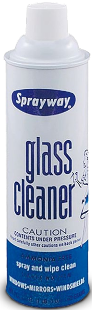
SPRAYWAY® Glass Cleaner