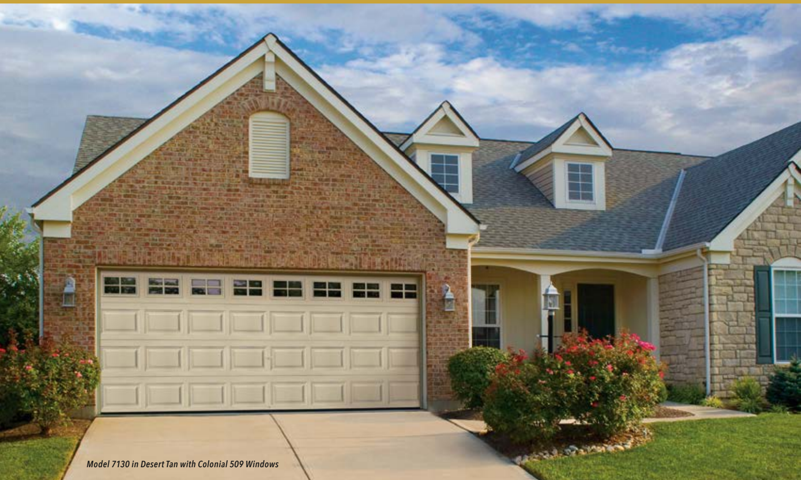
Model 7130 in Desert Tan with Colonial 509 Windows

Three-layer construction provides the quietest operation and superior durability. 1-3/8" thick Intellicore® polyurethane insulation is bonded to 27 gauge steel for maximum strength and energy efficiency. A short elegant raised panel style, multiple color options and a wide range of window options create a door that fits your budget and enhances your home's curb appeal.