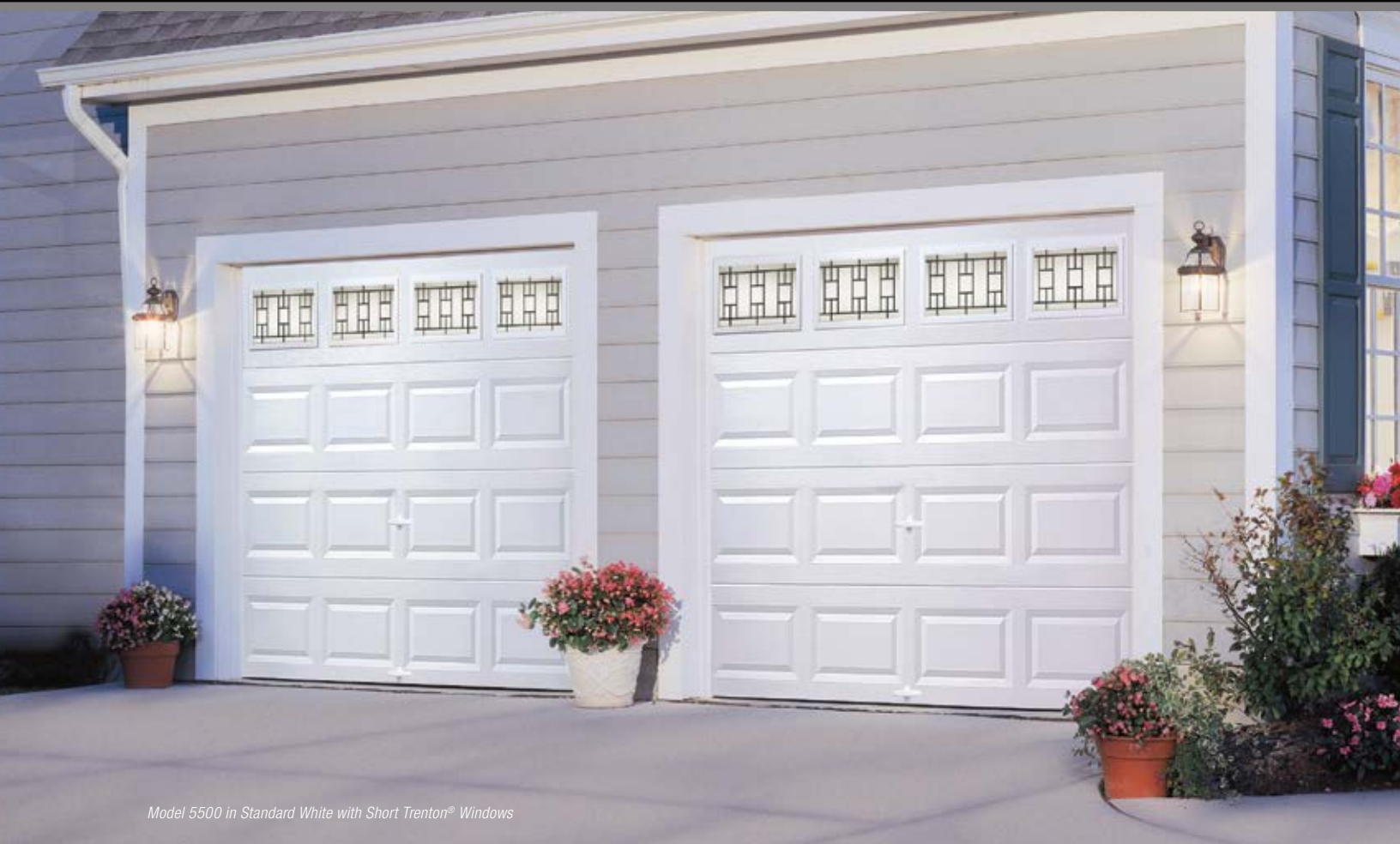
Model 5500 in Standard White with Short Trenton® Windows

Silver Series models are available with 1-5/16" polystyrene insulation providing comfort, energy efficiency and quiet operation in every season. A short traditional raised panel style, multiple color options and a wide range of decorative window options create a door that fits your budget and enhances your home's curb appeal.