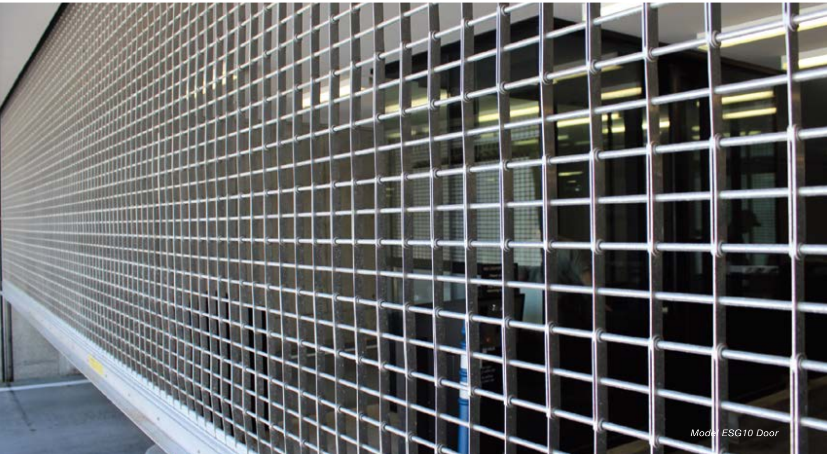
Model ESG10 Door