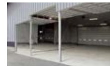
Carry-away, roll-away or swing-up mullions are available on select sizes.