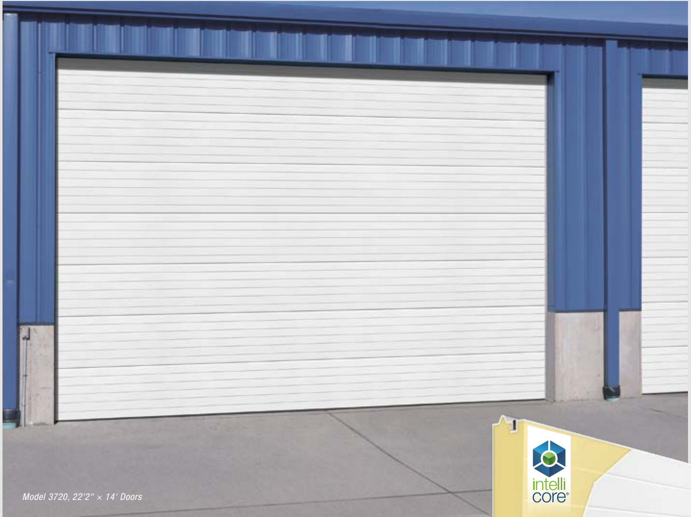
Model 3720, 22'2" x 14' Doors