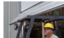
Single section and double sections available on select sizes.