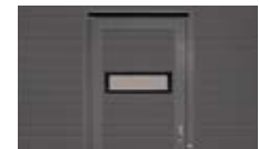
32" wide x 80" high, max 16'2" wide section.