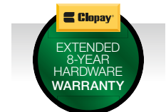
Increase the warranty with extreme duty hardware components.