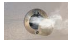
Can be cut into any type of sectional door. Available in select sizes.