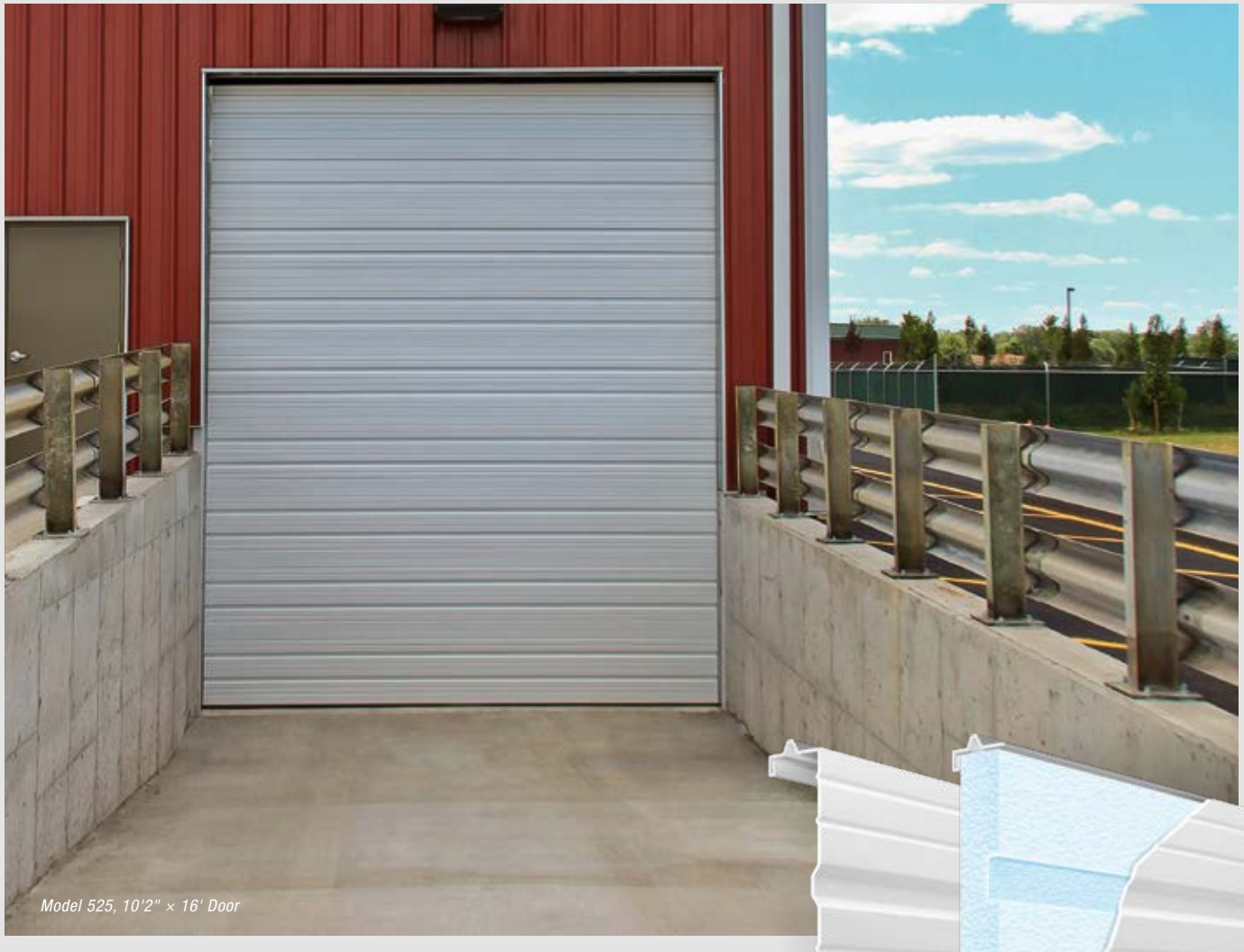
Model 525, 10'2" x 16' Door