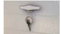
Outside keyed lock