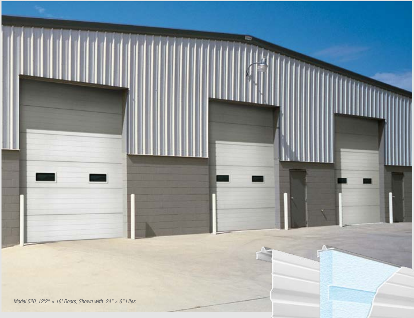
Model 520, 12'2" x 16' Doors; Shown with 24" x 6" Lites